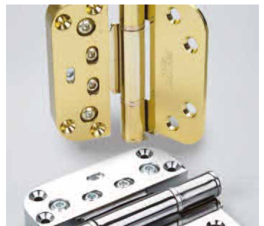
TOP: Loadpro 3D Adjustable Butt Hinges in (left to right) white powder coating, Supercoat 500 and yellow zinc. ABOVE: Polished brass and polished chrome.